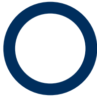
Asset mix (%)