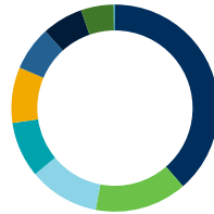
Sector Mix (%)