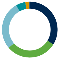
Asset mix (%)